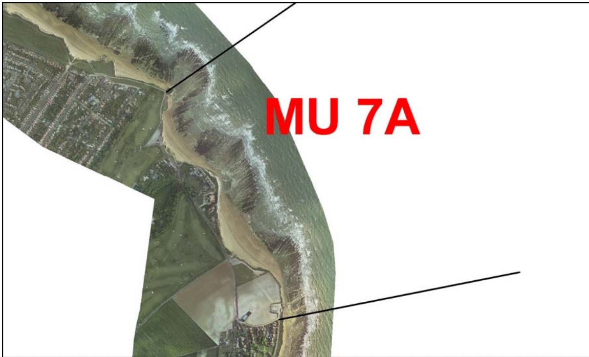
Figure 1: Management Unit 7A (North Foreland)